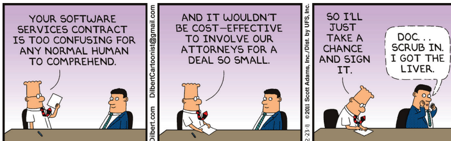
DILBERT: © Scott Adams. Used by permission of Universal Uclick. All rights reserved.