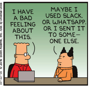
DILBERT: S Scott Adams. Used by permission of Universal Uclick. All rights reserved.