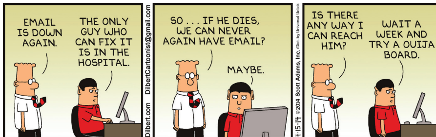
DILBERT: © Scott Adams. Used by permission of Universal Uclick. All rights reserved.

"These certifications," says Tim, "show our customers our commitment to using scalable, flexible technology solutions that enable them to build their own clouds without any upfront capital, which accelerates their time to market and time to revenue."