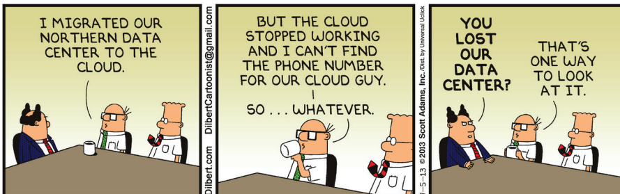
DILBERT: © Scott Adams. Used by permission of Universal Uclick. All rights reserved.

All contents copyright © 2016 by Quest® Media & Supplies, Inc., unless otherwise noted. Quest Strategic Advisor is published quarterly by Quest Media & Supplies, Inc. Information contained in this newsletter is believed to be reliable but cannot be guaranteed to be complete or correct. Quest Media & Supplies, Inc. assumes no liability for any use of this newsletter and/or the information or opinions it contains. Quest Strategic Advisor and questsys.com are trademarks of Quest Media & Supplies, Inc. Other product, service, and company names mentioned herein may be service marks, trademarks, or registered trademarks of their respective holders. To the best of Quest's knowledge, cited data and research findings belong to the organizations to which they are attributed and Quest Media & Supplies, Inc. asserts no claim to them. Quest® is a registered trademark of Quest Media & Supplies, Inc.